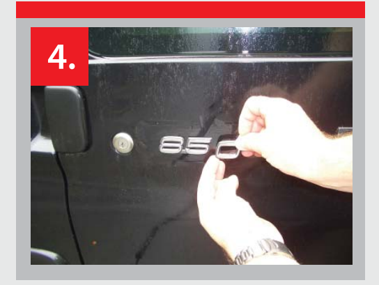
4. Clean the area where the badge is to be applied to. Apply the badge to the vehicle. Ensure that care is taken to make sure that you have the badge in the correct position.

JTAPE Limited, Hulley Road, Macclesfield, Cheshire SK10 2SF United Kingdom Tel: +44 (0)1625 618185 Fax: +44 (0)8701 207748 Email: info@jtape.com www.jtape.com