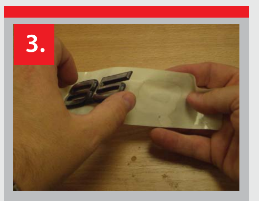
3. Lift the badge off taking the adhesive with it.