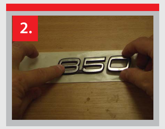
2. Place the badge onto the adhesive face. Apply pressure evenly onto the badge and on the back.

1. Peel backing strip off to expose the adhesive.